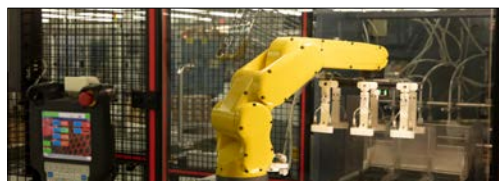
Industrial IoT / robotics & factory automation