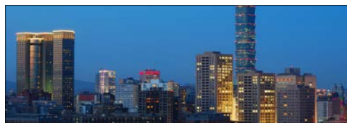
Smart city (HVAC, lighting, power monitoring/metering, parking meters)