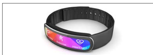
Wearables (smart watches, health monitors, AR & VR)