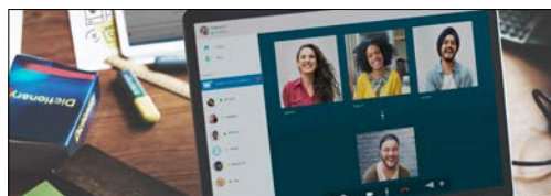
5G networking/telecommunications communication modules (Wi-Fi routers and mesh devices)